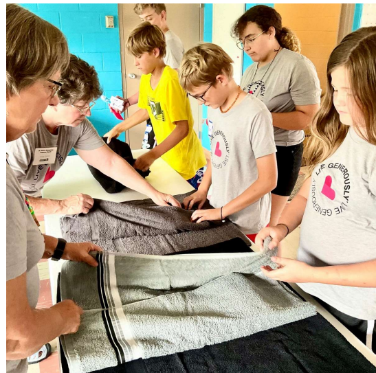
HopeWood Connect LOMO Outreach