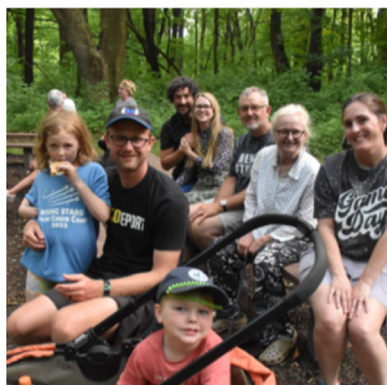
HopeWood Shores Camp Luther