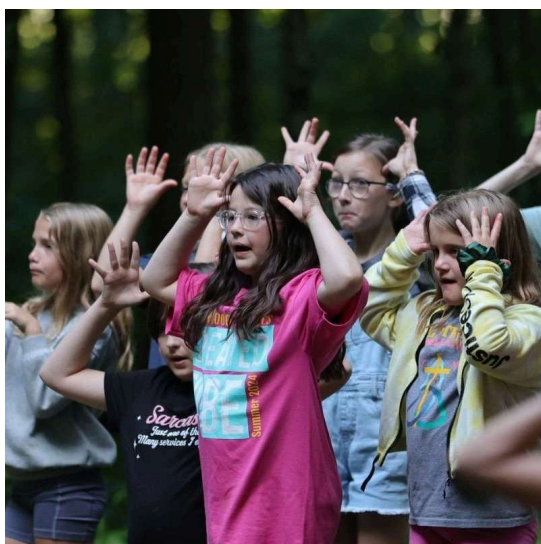
HopeWood Outdoors Lutheran Outdoor Ministries in Ohio