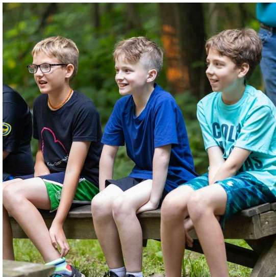
HopeWood Pines Lutheran Memorial Camp