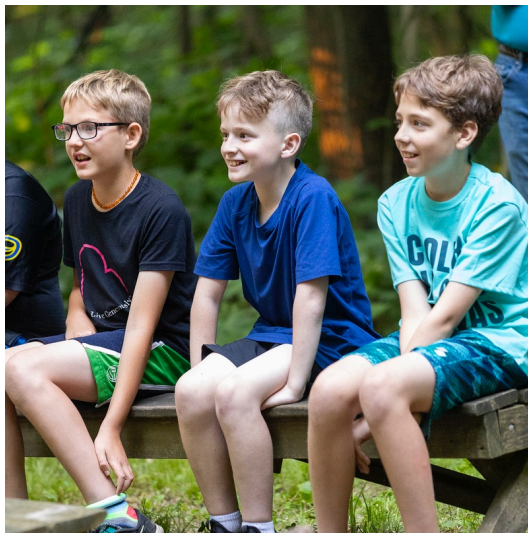
HopeWood Pines Lutheran Memorial Camp