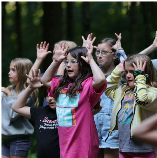
HopeWood Outdoors Lutheran Outdoor Ministries in Ohio