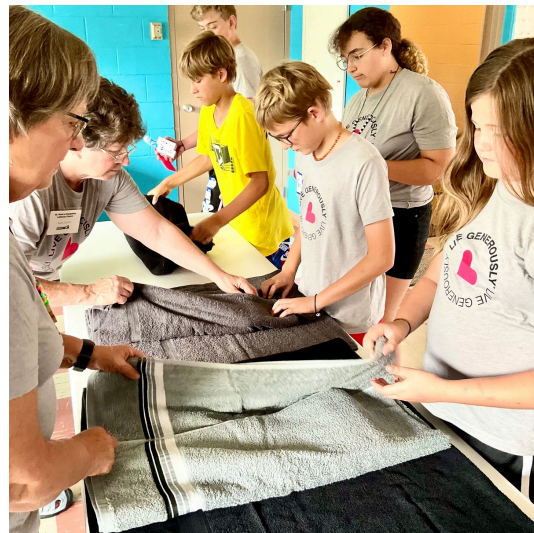
HopeWood Connect LOMO Outreach