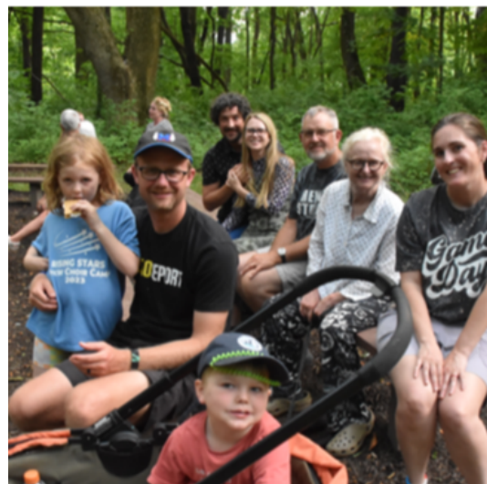
HopeWood Shores Camp Luther